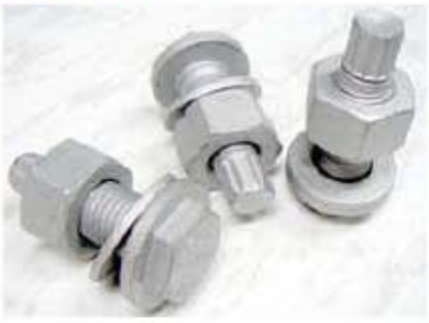
SmartHex™ TC bolts coated with Dacromet®

What is Dacromet?® Benefits - Cleaning - Processing Corrosion Resistance Dacromet® v. Galvanizing