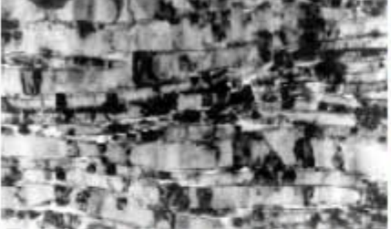
A transmission electron microscope photograph shows a cross section magnification of the DACROMET® film. (Magnification 80,000)