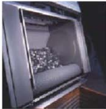
Typical tumble blaster used to clean scale from heat-treated parts.

Use of an alkaline wash solution removes manufacturing oils and other soils from the surface of parts. These alkaline cleaners are typically environmentally friendly, but they do not remove heat treat scale and a mechanical blast is required if the part has been heat-treated.